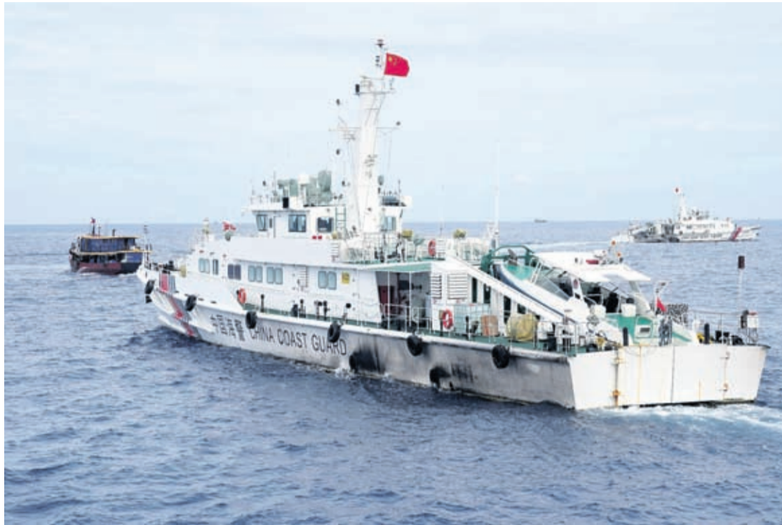
A Chinese coast guard ship tries to block the way of a Philippine supply boat, left, as it heads towards Second Thomas Shoal, locally known as Ayungin Shoal, at the disputed South China Sea on Aug. 22, 2023.

On Monday, the Philippine coast guard said it has complied with an order by President Ferdinand Marcos Jr. to launch a covert operation to remove the